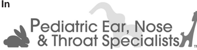
Photo ID Required at Check In